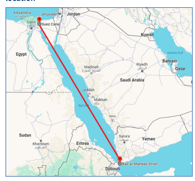
Figure 1 – Bab al- Mandab Strait and Suez Canal location

The Bab al-Mandab Strait holds strategic importance as it serves as the gateway to the Suez Canal, a vital waterway connecting the Mediterranean Sea to the Red Sea. Transit through the Suez Canal offers substantial time savings for vessels traveling between Asia, Europe, and North America<sup>1</sup>. However, the ongoing instability in the region has forced cargo vessels to seek alternative routes, leading to increased costs, extended transit times, and potential environmental impacts.