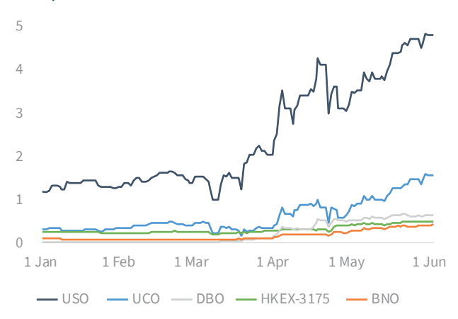
FIGURE 3: EVOLUTION OF AUM OF LARGEST OIL ETFS, YTD 2020 (USD BILLION)

In Figure 3 we show how the AUM for these five ETFs increased in size from 2 January 2020 to 1 June 2020.