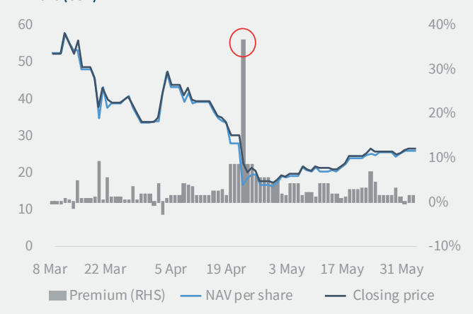
FIGURE 4: USO'S PREMIUM, NAV PER SHARE AND CLOSING PRICE, YTD 2020 (USD)