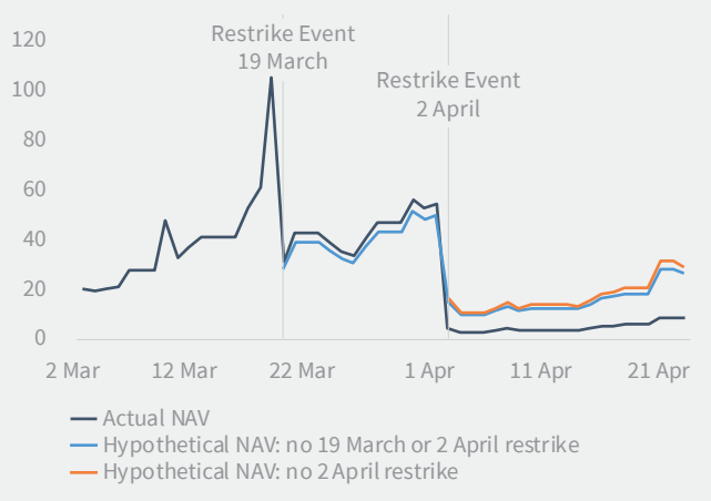
FIGURE 6: ACTUAL AND HYPOTHETICAL NAVS PER SHARE OF 30IS, YTD 2020 (USD) \,

Restrike Events led to intraday rebalances of WisdomTree's 3x short Brent ETC (3BRS) on 2 April and its 3x short WTI ETC (3OIS) on 19 March and 2 April. <sup>15</sup> These events are designed to protect investors against extreme losses; the intraday rebalancing lessens the severity of adverse movements later in the day. However, it also stops investors from recuperating losses if prices subsequently move in a favourable direction. To demonstrate loss protection coupled with the inability to recuperate losses, we present the actual and hypothetical NAVs per share of 3OIS in Figure 6.