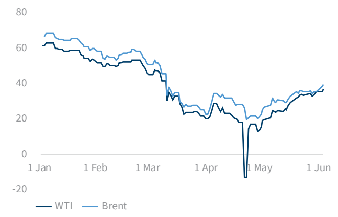
FIGURE 2: WTI CRUDE AND BRENT CRUDE FRONT-MONTH FUTURES PRICES, YTD 2020 (USD/BARREL)

Note: The WTI futures pictured are those traded on NYMEX while the Brent futures are those traded on ICE.